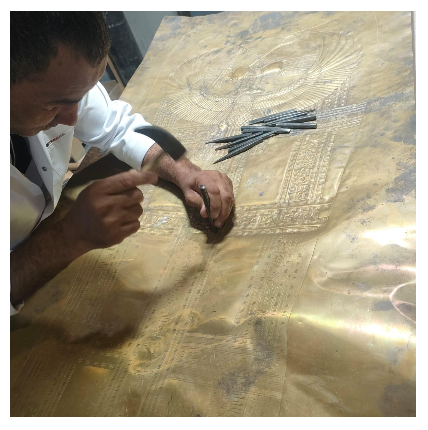
Image 8. Ancient Egyptian metal artisan hand edging inscriptions in the gold body sheath of Psusennes I