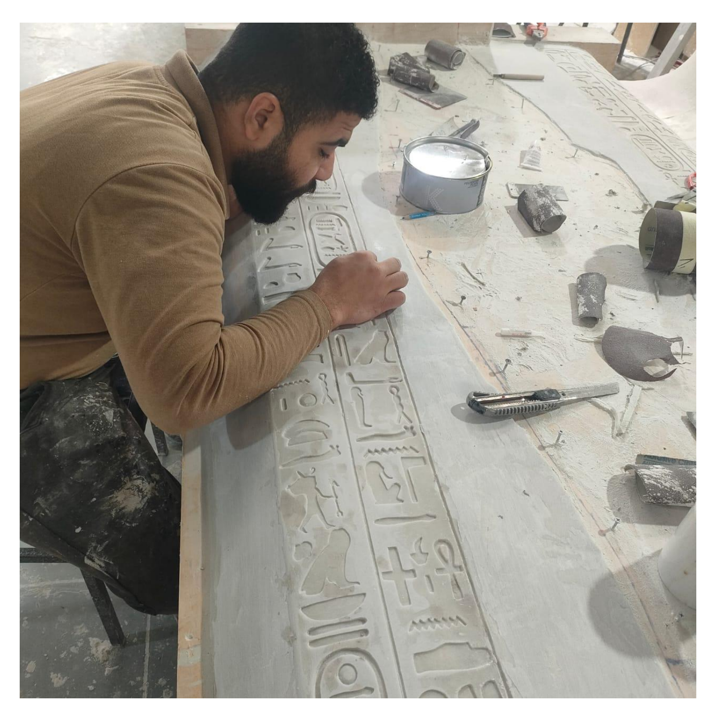
<u>Image 6. Ancient Egyptian hieroglyphics artisan hand carving inscriptions for the stone sarcophagus lid of Ramses IV</u>